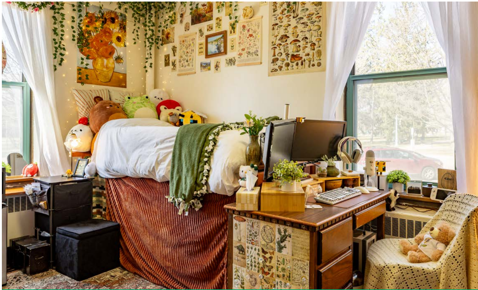
Room in Mason Hall