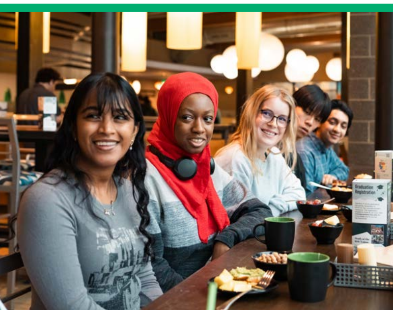
South Pointe at Case

MSU Culinary Services prides itself on being the largest university dining program in the nation. We prioritize crafting menu selections that are diverse, nutritious and delicious. We look forward to providing you with an outstanding dining experience! If you would like more details on our program, please see our digital resource at go.msu.edu/dietaryguide .